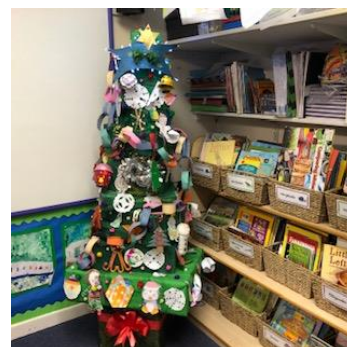
Tree of green painted boxes