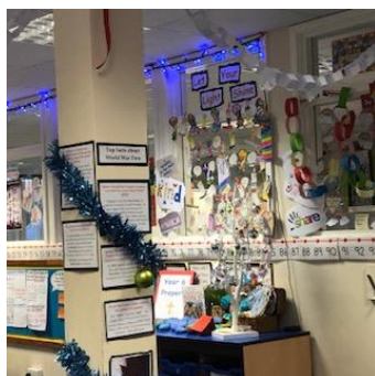
Diamond - tinsel & bauble pillars