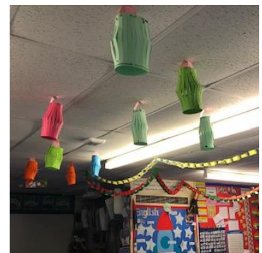
Pearl - ceiling lanterns