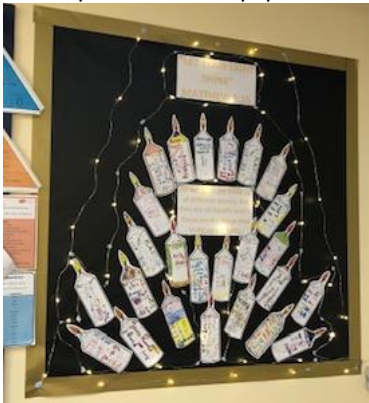
Amber - let your light shine