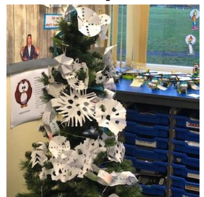
Ruby - paper decorated tree