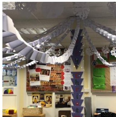
Emerald - maypole paper chains