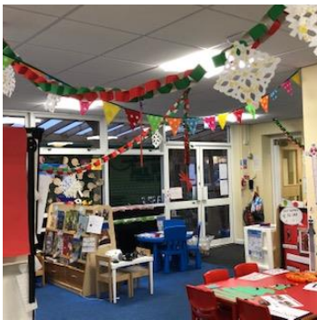
Amethyst - coloured paper chains

Here are examples from every class of the wonderful decorations, many hand-made, which have brightened up the school since the Big Switch-On on Friday 4 th December.