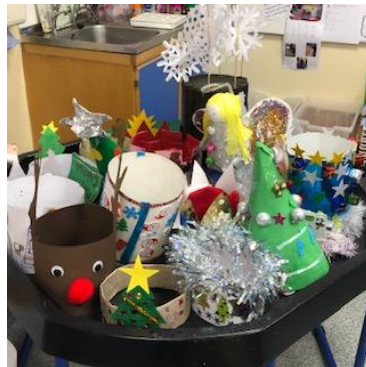
Sapphire - Christmas hats